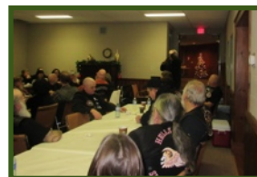
Bikers' Church Banquet

No matter the place, a local church, banquet, prison, community center or school there is someone who is always present to touch hearts and lives. Remember the Kingdom of God does not have a local address.